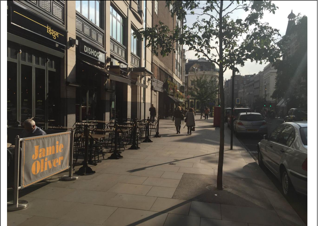
12 Upper St Martin's Lane